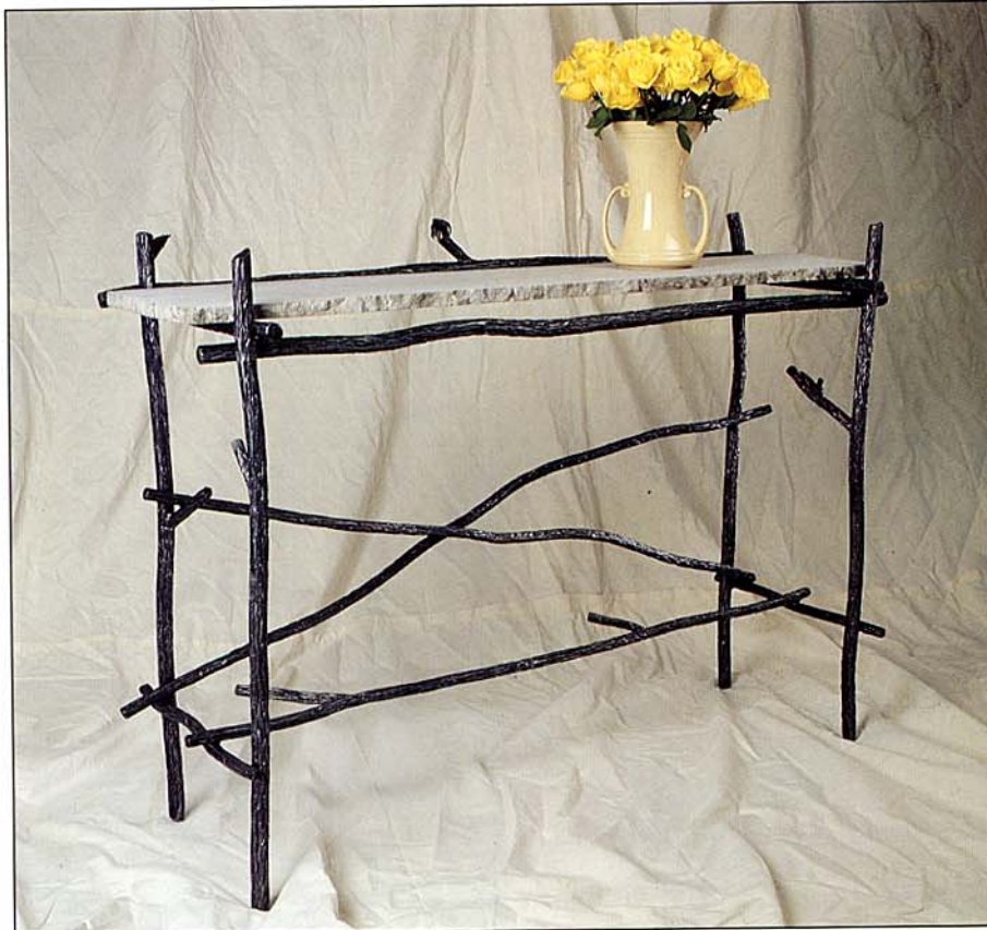
Twig Console, sandstone top, 48" L x 36" H