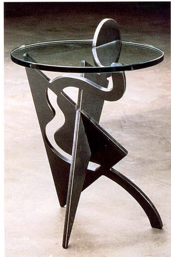
Battista Cocktail Table

H. DOLIN STUART The dynamic, intersecting shapes of the Battista Cocktail Table seem to dance to a rhythm all their own, while the slotted disc anchors the glass top above the sculptural form. This table is one of the latest in a series of designs by Pucci De Rossi, one of France's leading furniture artisans, and each piece bears his signature.